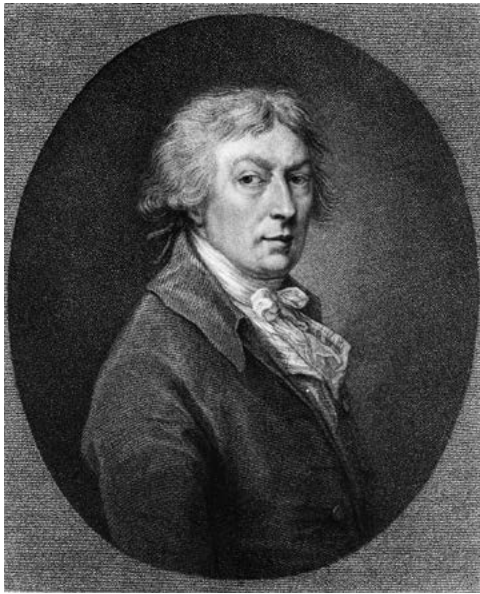
▲ Francesco Bartolozzi (1727–1815), after Thomas Gainsborough SELF-PORTRAIT Stipple engraving